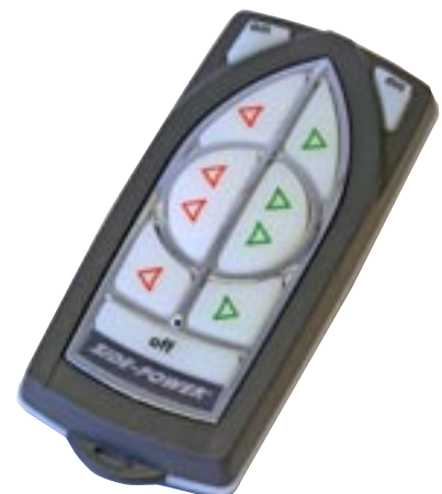
Bow & stern thruster Kit part code: 8980